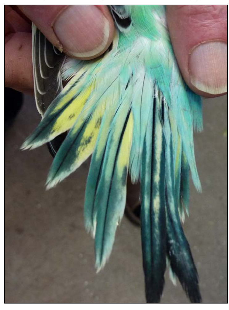
Spangle Opaline Sky from the same pairing – is this a double factor 'White Cap?