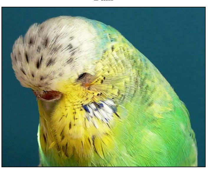
Opaline baby at various stages